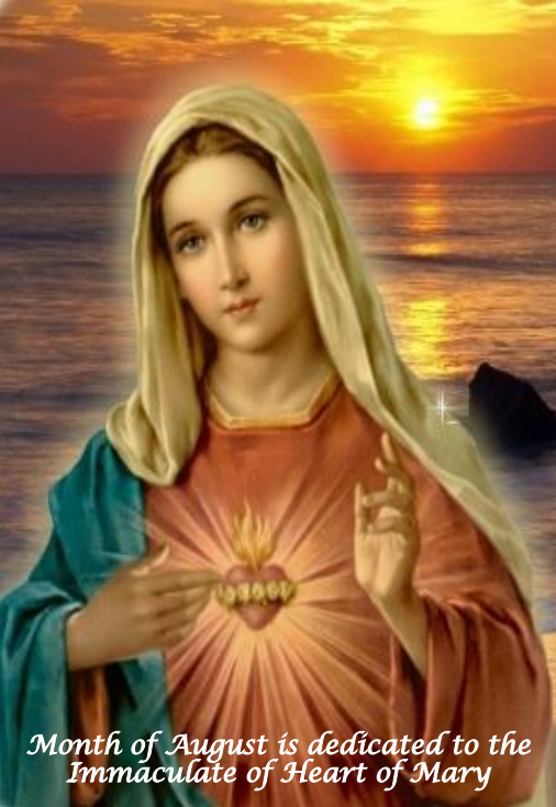
Month of August is dedicated to the Immaculate of Heart of Mary

Question: How can I practice gratitude in my everyday life? Answer: God has given each of us many blessings. Fostering an “attitude of gratitude” might be easier than you think. Simple, concrete practices can help us to be more thankful more often. Incorporate it into your dinner with your spouse, or as you tuck the kids into bed at night. “What are three things you’re thankful for today?” Make a habit of writing one note a week to someone special in your life, thanking them for how they’ve impacted you. This is also a good practice in the workplace. Consider opening your weekly meetings with a quick round of gratitude sharing. “I’m grateful John helped me with that last-minute change to my presentation last week. I wouldn’t have finished it in time for the meeting without him.” Another way is to designate a few minutes to thank God. This could be the first bit of your daily prayer time or after you receive communion on Sundays. You can also integrate it into your daily routine. How about while brushing your teeth? There’s probably nothing so important it can’t wait two minutes. Brush your teeth, quiet your mind, and thank God from your heart for His blessings throughout the day. Get creative! Any moment is an opportunity to praise and thank God. ©LPi