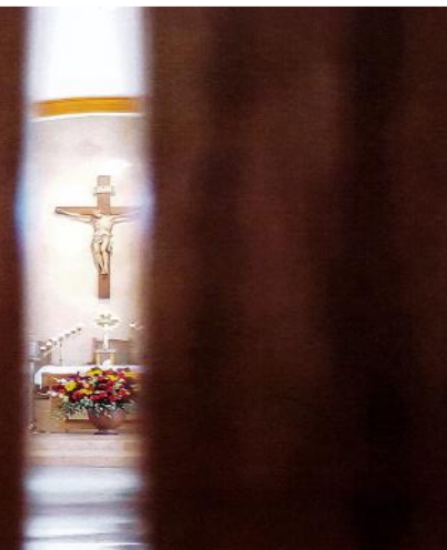
Photo taken from an open door at St. Pius X Jamul vestibule