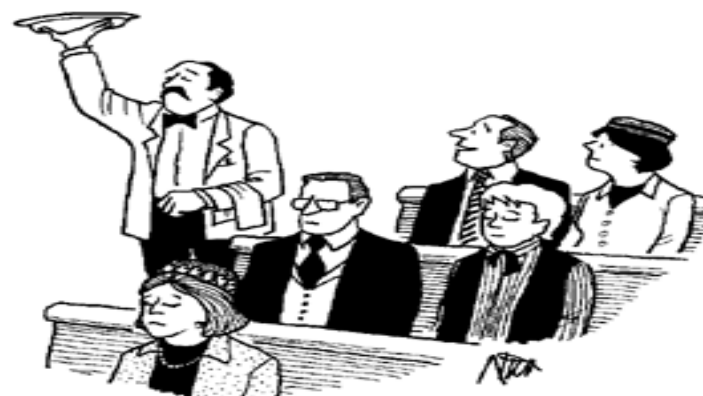
"HE SAYS IT ENCOURAGES PEOPLE TO ADD A 15 PERCENT GRATUITY TO THEIR OFFERINGS."