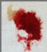
Sokolka Poland 2008 AD