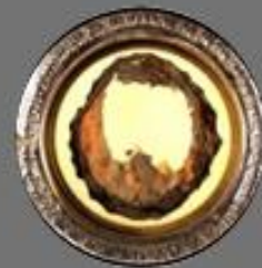
Lanciano Italy 750 AD

A Vatican sponsored exhibit highlighting 1800 years of Eucharistic Miracles created by Saint Carlo Acutis—as seen on EWTN.