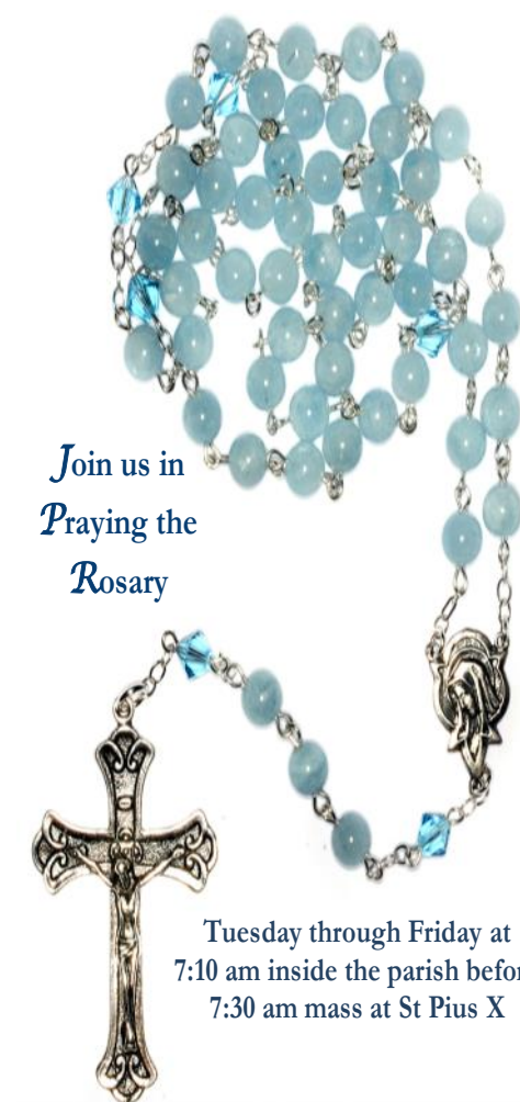
Join us in Praying the Rosary

Answer: Discerning a vocation can happen in any number of ways. It might come as a surprise to the person called or to family or friends. Sometimes it is a gradual process, and other times it is as quick and bright as lightning. Regardless of how it starts, a vocation to the priesthood or religious life requires a process of discerning, testing, and preparing. The best place to begin would be with lots of prayer, receiving the sacraments, and attending daily Mass whenever possible. Then talk to your pastor or a priest you know and trust. Your diocese may have a vocation director who can provide you with guidance and information. The Serra Club is also a great resource for information and contacts to help you discern if indeed God is calling you. Remember that many young Catholic men have considered the priesthood. Some are ordained and others realize this is not their calling. However, we are all called to be of service to others as we practice our faith. These are extraordinary times in which we live, and they require an extraordinary witness to faith and to God's presence in the world. Our work, our ministry as Catholics, is to be the body of Christ with and for others. The Church needs priests. If God calls you to ordained service in the church, He will provide the grace, direction, and support you need. Just listen and respond with all your heart, mind, and soul. ©LPi